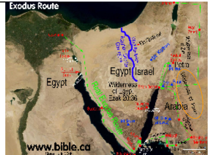
The Modern Wilderness of Paran